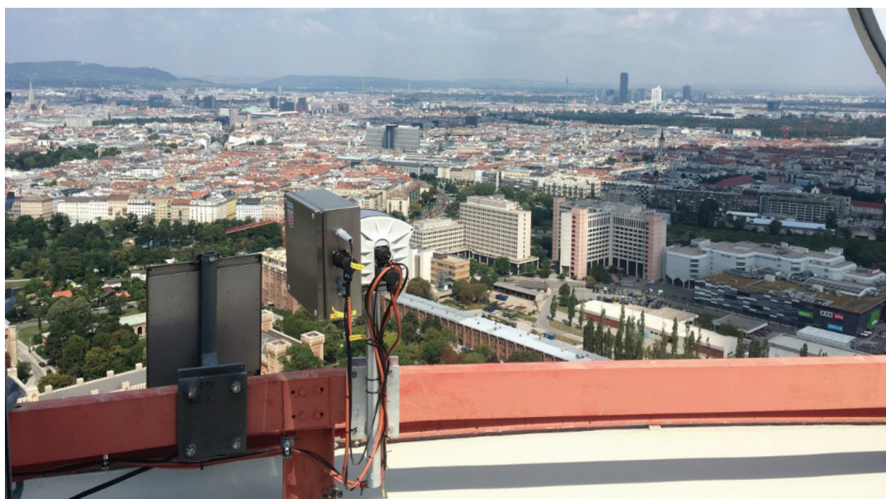
New measuring techniques enable 3D images that show the distribution of air pollutants, as in this pilot project.

Depending on the weather conditions and the amount of aerosols in the air, the three instruments can look several kilometres into the distance. Since their measuring ranges overlap, special opportunities arise, as Schreier explains: "We try to derive the spatial distribution of nitrogen dioxide from the many horizontal