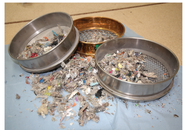
Figure 1: An example of a typical sample received for analysis by MSSL

The carbon concentration when measured in conjunction with the calorific value gives a measure of the energy content and therefore the usefulness of a material as a renewable energy source. The hydrogen concentration is another key parameter to be measured and is used to calculate the net calorific value of fuels.