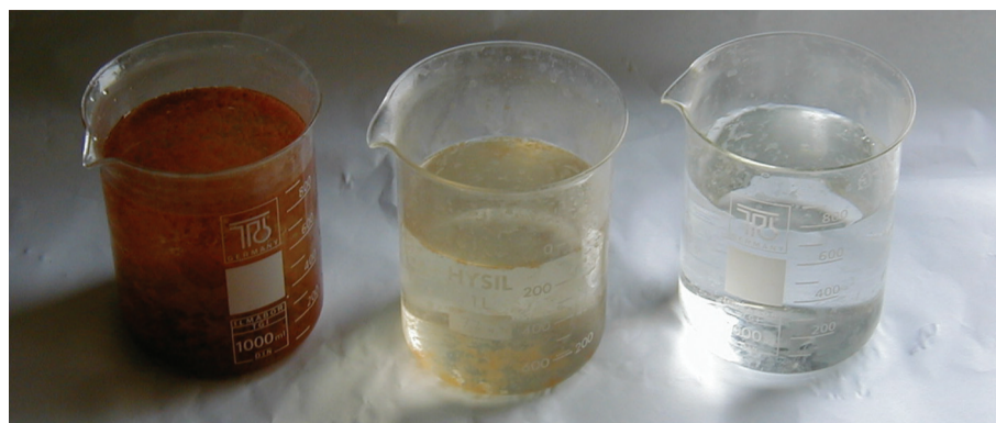
Water before, during and after treatment at ABB de-oiling plants