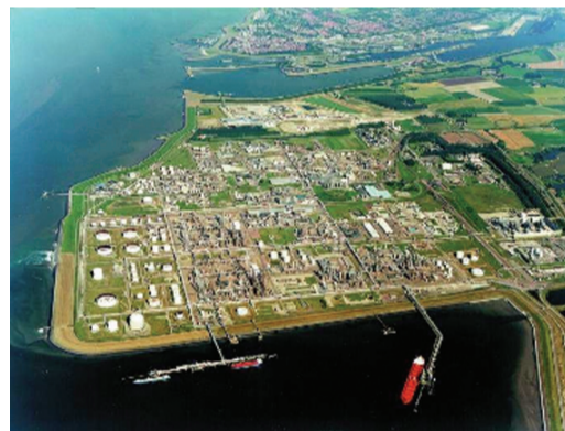
Aerial view of the Dow Terneuzen site