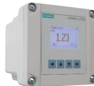
Sitran LUT400 ultrasonic level controller

Through economy pumping and I&I monitoring, Sitrans LUT400 gives companies the potential for significant energy savings. One Sitrans LUT400 user stated that every small change his company makes to reduce consumption has the potential to save millions of dollars each year.