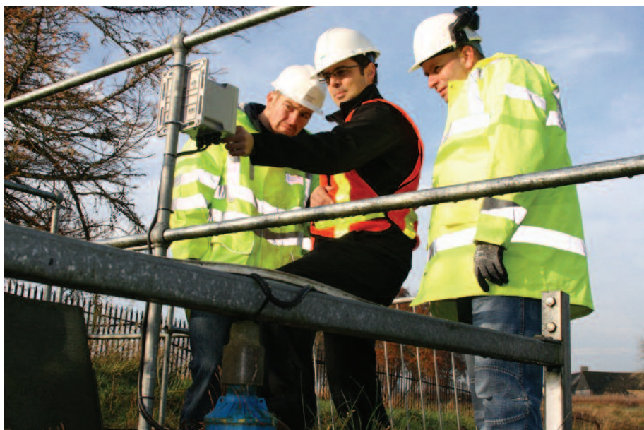
Setting up an economy-pumping regime and performing infiltration and ingress monitoring is simple and can cut your company's energy costs dramatically.